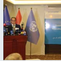
P40 United Nations Human Settlements Programme (UN-HABITAT)