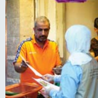
P48 International Trade Center (ITC)