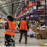
P24 | Resident Coordinator Office (RCO) Development Support Office (DSO)