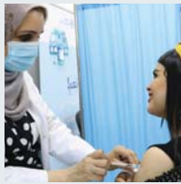
P66 World Health Organization (WHO)