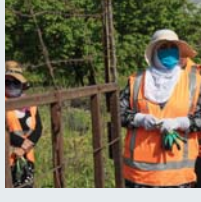
P78 International Labour Organization (ILO)