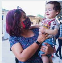
P50 United Nations Children's Fund (UNICEF)