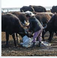
P38 United Nations Environment Programme (UNEP)