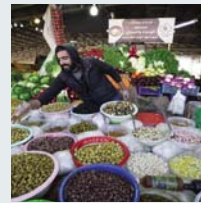
P64 World Food Programme (WFP)