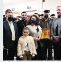
P34 United Nations Development Programme (UNDP)