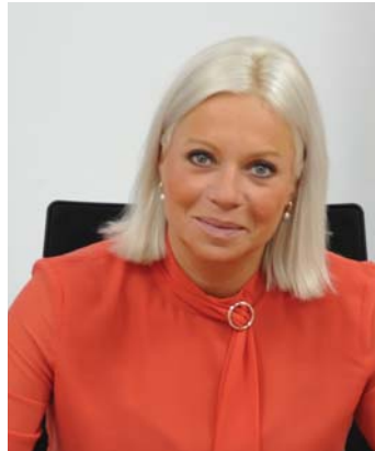
Ms. Jeanine Hennis-Plasschaert

Special Representative of the United Nations Secretary-General for Iraq and Head of UNAMI