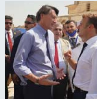
P54 UN Educational, Scientific and Cultural Organization (UNESCO)