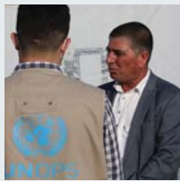
P60 United Nations Office for Project Services (UNOPS)