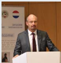
P56 United Nations Mine Action Service (UNMAS)