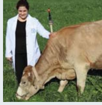
P32 Food and Agriculture Organization (FAO)