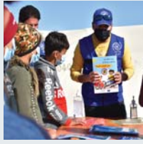
P72 International Organization for Migration (IOM)