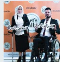
P58 United Nations Population Fund (UNFPA)