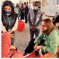
P44 United Nations High Commissioner for Refugees (UNHCR)