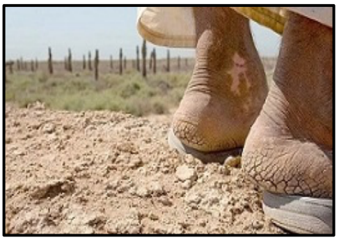
Warning of the worsening phenomenon of desertification@local media

The project will create approximately 3,000 job opportunities for agricultural college graduates. They will be responsible for managing and maintaining the project.