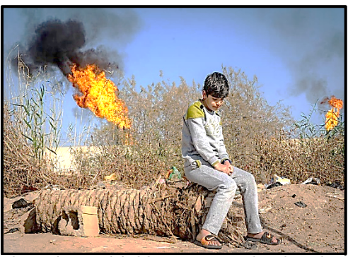
Flares from oil fields in Basra

Due to pressure from human rights and environmental activists, as well as the affected local communities, the government is finally considering options to curb flaring and urge investors to consider their social responsibilities. But can these wasteful and polluting practices be really stopped and cured?