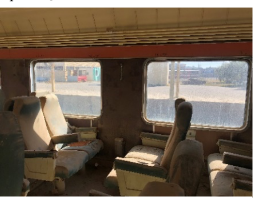
Trains waiting for a connection at Kirkuk Station since 2003.