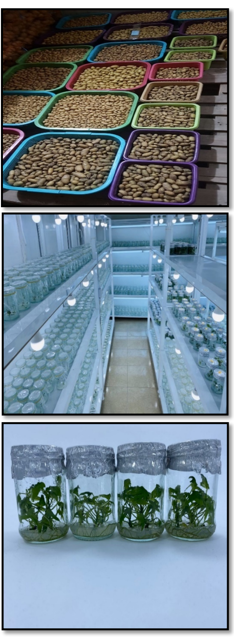
Potato varieties 'Yousif' and 'Atra' in college of agriculture lab

Another project the department is working on is that of the Paulownia tree, which is very fast-growing and good for producing wood and flowers, especially benefiting bees and leaves used for animals feeding.