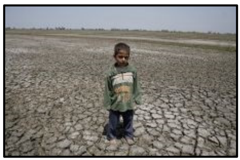
Soil degradation in Thi-Qar@ local media

Climate change and global warming have started to exert a noticeable impact on Iraq<sup>5</sup> and the entire region, attributed to a decrease in water resources, including rainfall and increasing temperatures, humidity, evaporation and sandstorms.