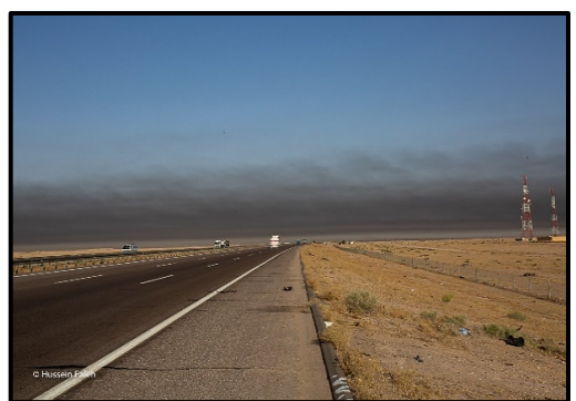
Row of smoke along the horizon in Rumaila oilfield.

In 2021, Iraq contracted with the French company Total Energies as a step towards phasing out gas flares and part of a holistic plans for an optimal gas investment.<sup>2</sup>