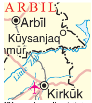
UN maps show railroads that no longer exist.

In 2003, the bridge over the Tigris River at Al Futha in Salah-al-Din was destroyed. This severed Kirkuk's link with the Iraqi Rail Network. If this bridge were to be repaired, Iraqi Railways would be able to move passengers and haul cargo from Kirkuk via Bayji across the 'southern connection' to Baghdad and all the way down to the port of Basra.