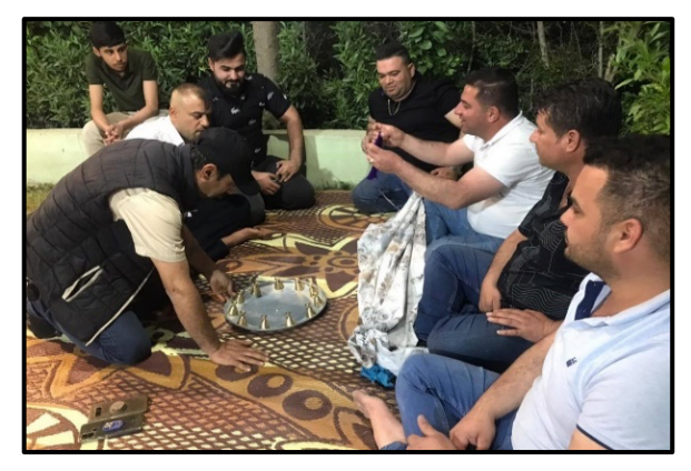
A group of people from different ethnic groups play a game of Seni Zarf at a café on Ramadan night