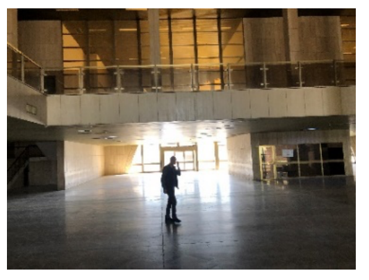
Kirkuk Train Station only needs a few minor repairs.

Regrettably, all stations along the once venerable Kirkuk-Mosul line sit empty and unused.