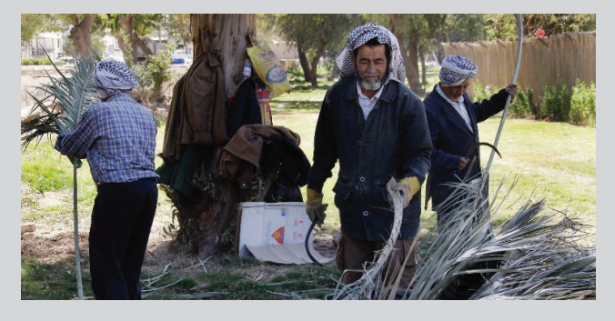
Enhancing labour governance, inspection and working conditions in response to COVID-19