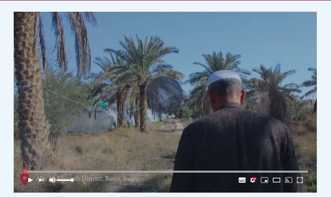
Video: Rural women develop skills in Iraq's date palm sector