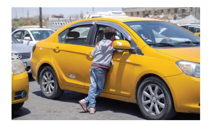
On this World Day Against Child Labour, ILO and UNICEF call for joint work among all stakeholders to create a protective and inclusive environment for children in Iraq