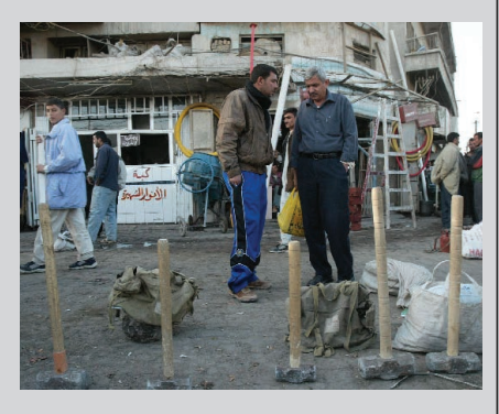
Employment Policies formulated in Iraq using strengthened LMI systems and LM statistics