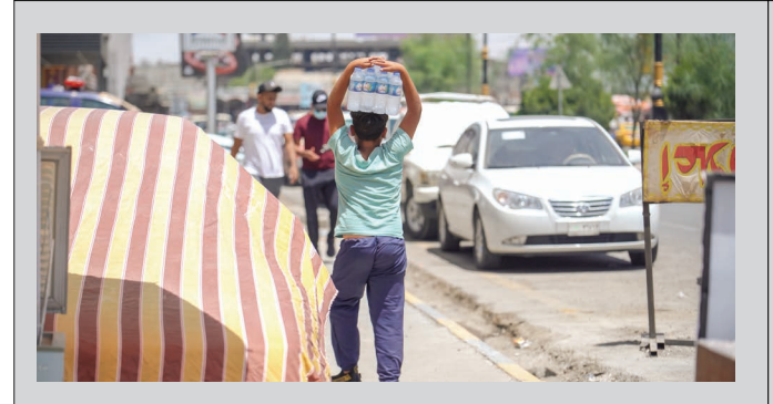
Tackling the worst forms of child labour amongst IDPs, refugees, and vulnerable host communities in Iraq