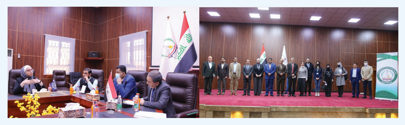
A meeting between the ILO and the Deputy Governor of Basra Mr. Hasan Al Najar highlighted ILO's Decent Work Country Programme being implemented in Iraq

An ILO capacity building training programme for rural women in Basra seeks to foster skills, entrepreneurship and decent employment in the field of agriculture, funded by the European Union.