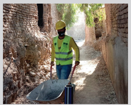
Creating decent job opportunities through applying Employment Intensive Approaches at Cultural Heritage Conservation activities