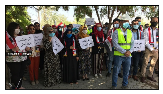
Students advocating for change in Kirkuk. With no job opportunities, many recent graduates have since emigrated from Iraq.

Many first-time voters are disappointed with elections. They wish the 'old' politicians, who lost many votes would make way for new parties. They were hoping for the next generation of leaders, but they see sons and cousins 'inherit' a position in government.