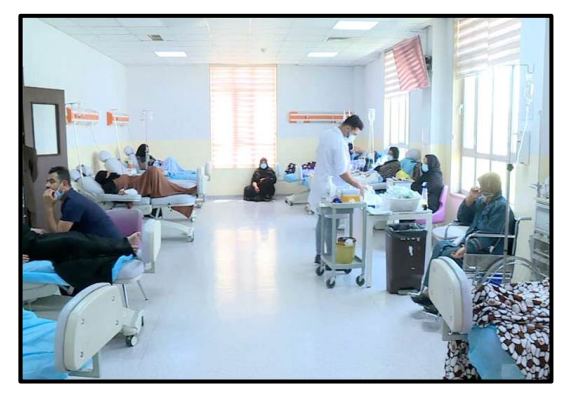
Hiwa cancer treatment hospital in Sulaymaniyah © media

Hawrami suggests that the stoppage of health sector support from Erbil might be political Sulaymaniyah hospitals © media pressure applied to Sulaymaniyah.3