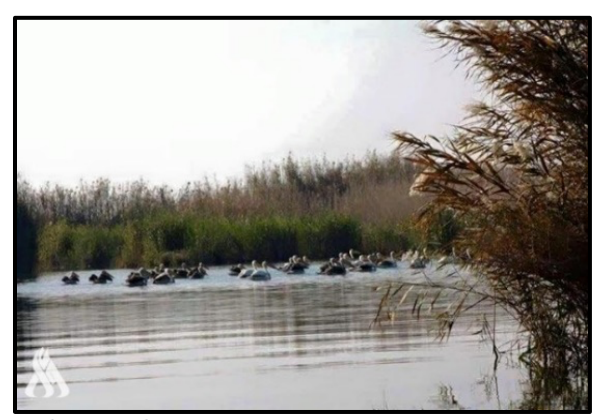
Teeb natural reserve in Missan

With few tourists, the natural reserve proponents have sometimes struggled to incentivize locals to buy-in for protecting their native environment. Desperate to salvage the ruins of the region's battered environment, conservationists and officials are struggling to carve out a string of new wildlife reserves in the area.