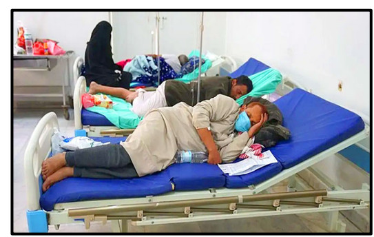
Cholera patients receive treatment in

The increased public outcry over the state of affairs of the health sector and the fear of possible protests from Sulaymaniyah forced Erbil to take note. Then on May 19, Kurdistan Regional Government (KRG)'s Health Minister Saman Hussein Barzinji announced, that the ministry will increase the monthly budget allocated for the purchase of medicine and other medical supplies.