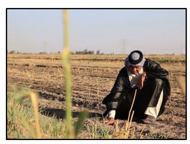
Water shortage for paddy plantation

The decision by the Ministry of Agriculture (MoA) to reduce land allocated to paddy plantations translates to a loss of over