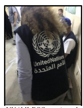
UNAMI-DSO monitored the elections in Kirkuk at the request of IHEC and Electoral Affairs Office.

Fortunately, the Kirkuk government in 2021 had an implementation rate of only 70% for ongoing projects. This means that money not spent can be carried over to 2022.