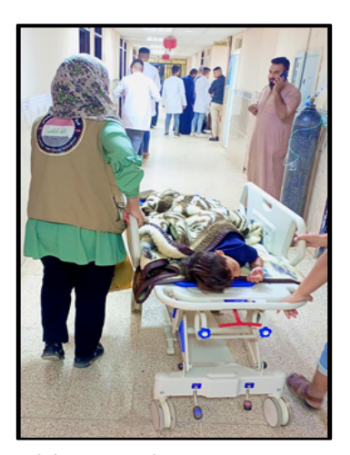
Alif Dinar Volunteer team accompanies a child to the surgery room in Hospital

The team is officially licensed by the Voluntary Work Center at the Ministry of Youth and Sports, and the team's management plans to upgrade themselves to an organization, and register it with the Ministry of Planning, to get more support from donors, open other branches, and train more youths in volunteering skills.