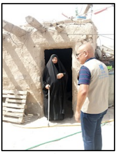
DSOs visit to a slum in Nassriya @ DSO

But those numbers have risen lately due to the repercussions of COVID-19. Thi-Qar is still among the poorest governorates, also ranked first in the number of suicides and drug abuse in the last few years.