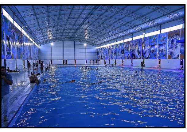
The swimming pool of the amusement park in Kut City

During Eid, families exchange visits, and children get candies and the Eidia (some cash) which is one of the most important Eid rituals for children, so they rejoice a lot when they receive it from family members and relatives, no matter how simple, they are always looking forward to it.