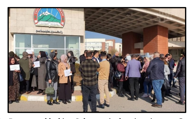
Protestors blocking Sulaymaniyah university gate