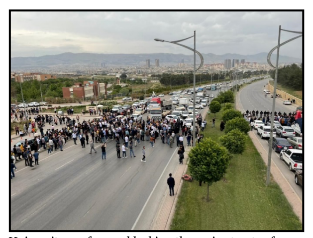
University professors blocking the main streets of Sulaymaniyah

The professors DSO met with were physicians, engineers, lawyers, and journalists. They either have jobs in the private sector or run their own businesses to