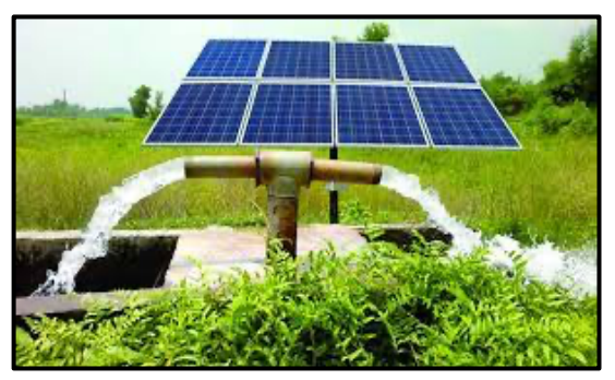
Solar well pump system

Despite the benefits of renewable energy, including lower greenhouse gas emissions and pollution, most consumers in Iraq lack knowledge about solar energy and its feasibility as an alternative power source. For others, it is unaffordable, as the cost related to the installation of a solar unit that feeds one house costs around $2,400 - $3,500.