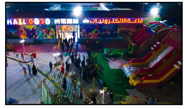
Inflatable bouncy slides and the entrance of the digital games' hall in the amusement park in Kut City