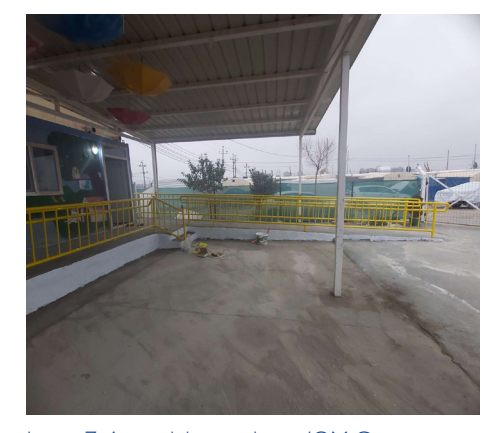
Image 7: Accessibility works on IOM Community Centre in Dohuk Governorate

Accessible construction is now one of the topics in the annual training workshops for all engineering staff, and internal quality improvement processes such as mentoring by disability-inclusion staff and senior engineers, BoQ endorsement sessions and meetings with contractors have assisted staff to work towards good accessible design and rehabilitation. Staff are now much more confident regarding accessible construction and can even propose to authorities that accessibility should be a consideration in construction of public places.