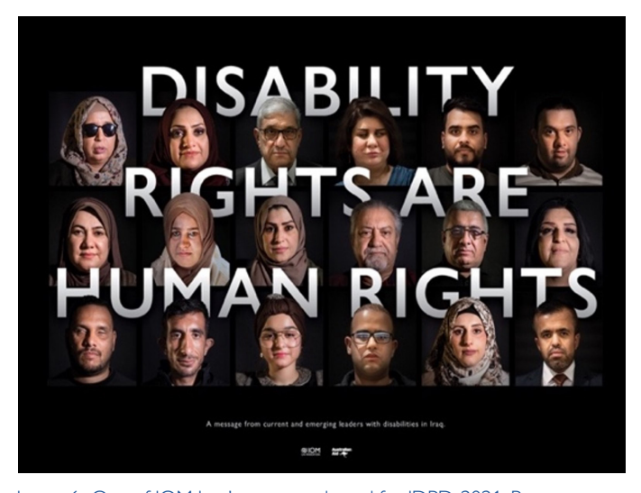
Image 6:: One of IOM Iraq's posters released for IDPD-2021. Posters are available in Arabic, Kurdish and English.

To address the need for rights-based disability-inclusion videos for internal IOM Iraq capacity building activities and community and stakeholder awareness. IOM developed three disability-inclusion awareness videos featuring direct messages from persons with disabilities. These videos are available with Arabic, Kurdish or English captions. Two videos showcased a selection of key messages from persons with disabilities in Iraq and key messages from OPDs in Iraq gathered as part of the OPD consultation report. The third video showcases messages from current and emerging leaders with disabilities. One video was launched on International Day of Persons with Disabilities (IDPD) in 2020, another as part of the OPD consultation report launch in March 2021 and third was launched on IDPD 2021. Last, IOM Iraq funded an Arabic translation of European Disability Forum's video on How to include organizations of persons with disabilities in humanitarian action.