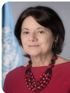
Rosemary A. DiCarlo Under-Secretary-General for Political and Peacebuilding Affairs

This joint effort illuminates the power and potential of dialogue and rights, and demonstrates that successful peacemaking embraces the fundamental rights of all parties involved, including those most marginalized. By integrating the mediation process with human rights considerations, we hope and aspire to increase the odds of reaching more inclusive and just peace agreements, which in turn, contribute to a more sustainable peace.