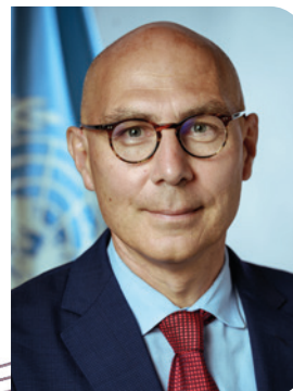
Volker Türk High Commissioner for Human Rights