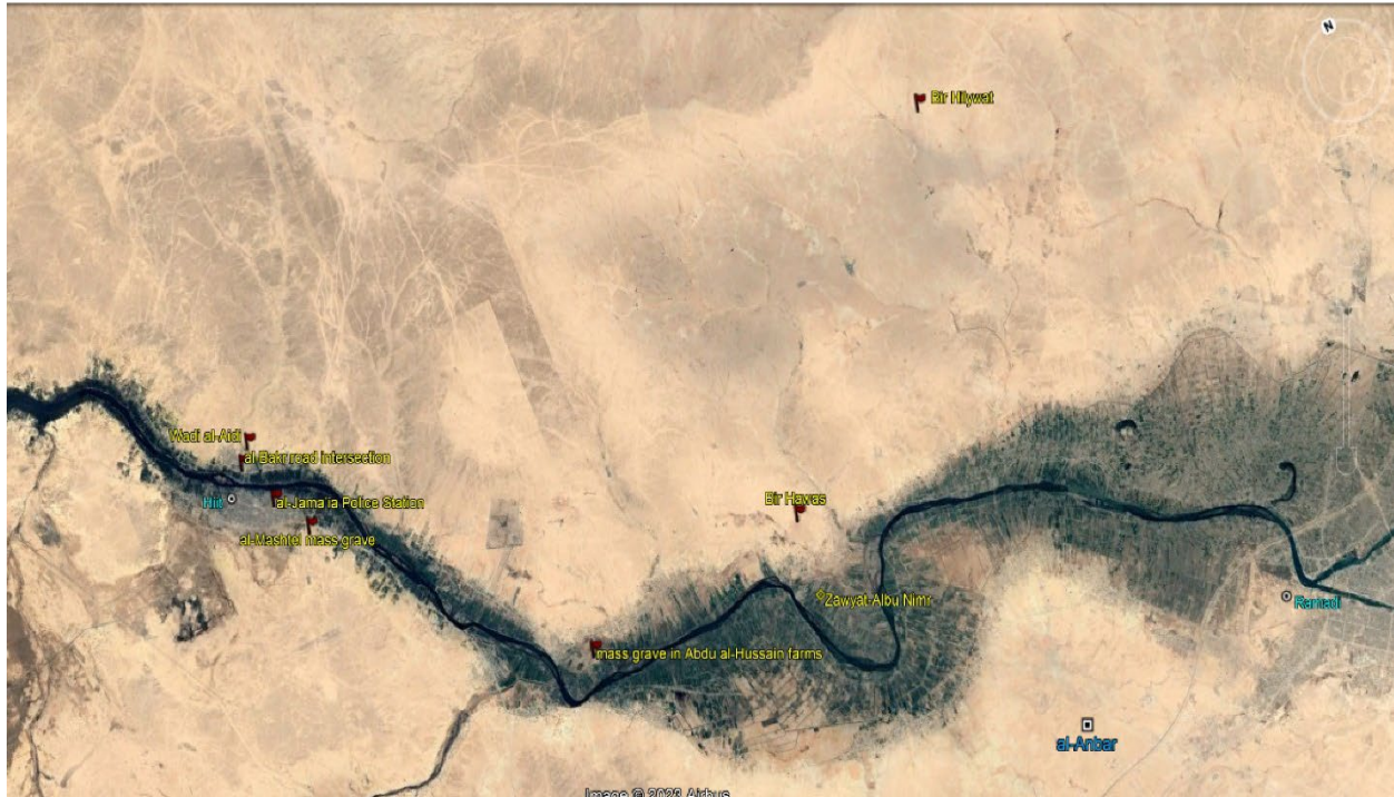
Map of the main crime areas, extracted from Google Earth.