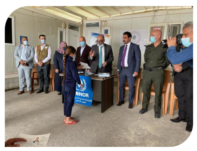
Ceremony marking handover of civil documents through mobile missions in Dohuk 2021

UNHCR continues to support mobile missions by government officials to IDP camps to receive and process applications for civil documents and to issue civil documentation.