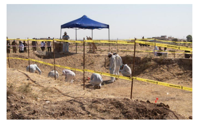
Exhumation of mass graves in Sinjar.

It is estimated that 2,800 Yazidi women and children remain missing since the ISIL attacks on Sinjar in August 2014. Humanitarian partners continue to provide SGBV and other protection services for Yazidis and other conflict-affected Iraqis, including case management, referrals, training, legal assistance and community awareness. COVID-19 has brought new challenges to the provision of such assistance, particularly during periods of movement restrictions which limit ability to access services. Partners have adjusted to tele-case management by phone and remote monitoring where possible.