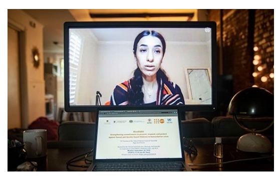
Nobel Peace laureate Nadia Murad addresses delegates in the virtual high-level event.

More than 1,000 delegates took part in a high-level virtual event during the 75<sup>th</sup> United Nations General Assembly aimed at strengthening commitments to prevent, respond and protect against sexual and gender-based violence (SGBV) in humanitarian crises. The high-level event was hosted by the governments of the United Arab Emirates, Norway and Somalia, in coordination with OCHA, UNFPA, and the International Committee of the Red Cross. Keynote speakers and Nobel Peace Prize laureates Nadia Murad and Denis Mukwege highlighted the disproportionate concentration of SGBV in conflict and disaster zones, especially in the midst of the COVID-19 pandemic. Ms. Murad, a Yazidi survivor of conflict-related sexual violence, spoke of the need to work collectively and collaboratively to