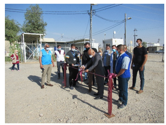
Breaking ground in Kirkuk

On 25 October, OCHA attended a ceremony with the Kirkuk Directorate of Health formally opening the COVID-19 isolation area in Laylan 2 IDP camp in Kirkuk. The isolation area will serve 8,874 IDPs from Laylan 1 and Yahyawa camps. IOM will provide health management for the isolation area, which is linked through a referral system to the nearby Médecins Sans Frontières treatment centre and Kirkuk Hospital. UNICEF will provide WASH services, UNHCR will support with shelter and non-food assistance and the World Food Programme (WFP) will provide food assistance. At the time of writing, there were no COVID-19 cases in either camp, although limited numbers of cases had been recorded in recent months. The Health and Shelter/NFI clusters issued guidelines on COVID-19 Preparedness and Response in IDP Camps, including the establishment of quarantine and isolation units, which were published on 7 October 2020.