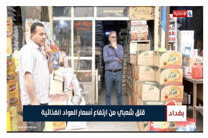
No one is interested in buying food items @IMN

Hannoun indicated that there are accelerated measures to secure foodstuffs, especially oil and sugar. He added that work is underway to find a parallel line to support the government's approaches through the commercial market and pump large quantities of food baskets to beneficiaries.