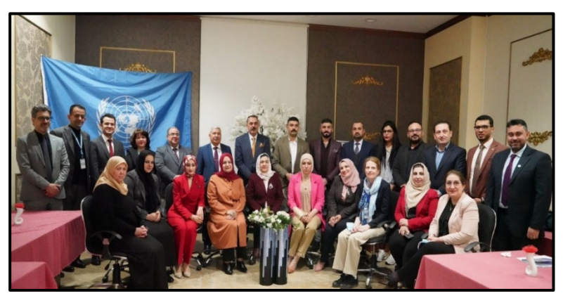
Participants concluding the Round Table Discussion to celebrate International Women's Day in Kirkuk.