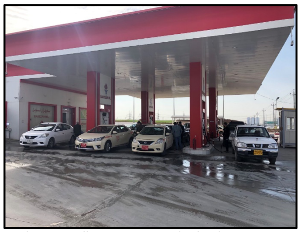
Fuel station sells government-subsidized fuel in Erbil

The supply of this fuel is also limited, as only 20 fuel stations receive and sell the Iraqi government-subsidized fuel in Erbil Governorate. He said the scarcity of affordable fuel has led to racketeering, fuel smuggling from neighboring governorates, and black-market trading. Shortages of fuel are reported in neighboring Ninewa Governorate due to the influx of drivers from Kurdistan searching for cheaper gasoline.