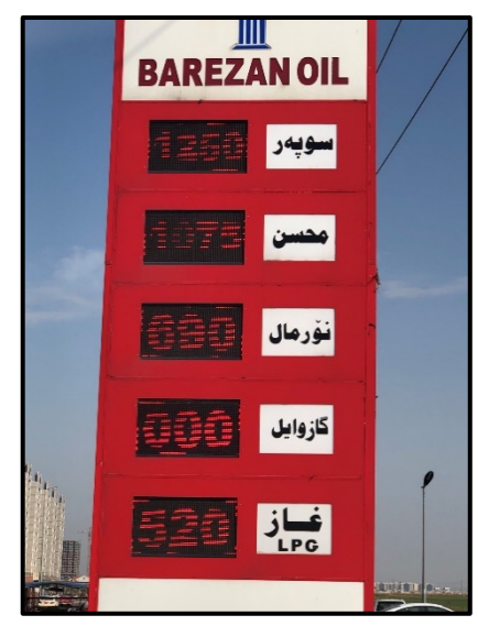
Fuel prices board of a fuel station in Erbil

Unless the local authorities step in to subsidize the current prices or remove some tariffs, the prices will continue to rise. Unfortunately, the crackdown on illegal refineries and the blackmarket sellers by local government officials also affected the local oil market. The full control over fuel prices is now in the hands of pump operators and their distributors.