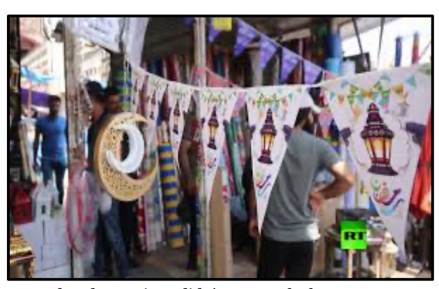
Ramadan decorations didn't attract the buyers @RT