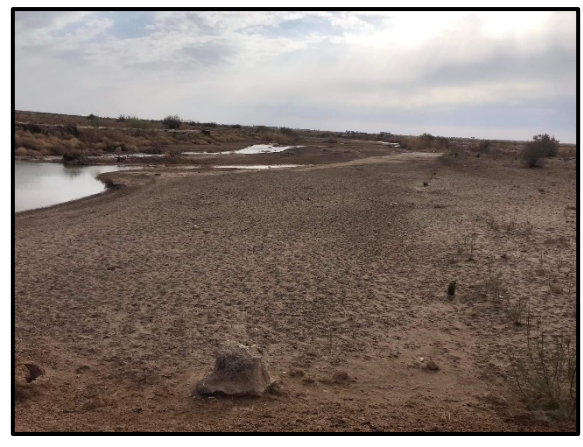
Al Adhim river drought stream in northeast of Dhuluiyah sub-district.

"Time is out for our farms to grow properly and produce even if we get irrigation water now." Not only have these farmers expended a lot of money on their farms, but they still have hope that the government may sympathize with them and compensate them for their losses.