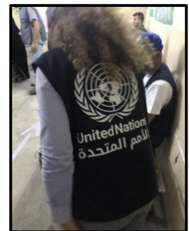
UNAMI-DSO monitored the elections in Kirkuk at the request of IHEC and Electoral Affairs Office.

Many first-time voters are disappointed with elections. They wish the ‘old’ politicians, who lost many votes would make way for new parties. They were hoping for the next generation of leaders, but they see sons and cousins ‘inherit’ a position in government.