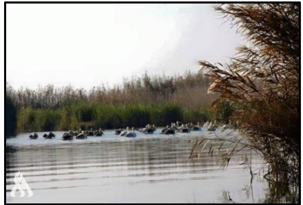
Teeb natural reserve in Missan

With few tourists, the natural reserve proponents have sometimes struggled to incentivize locals to buy-in for protecting their native environment. Desperate to salvage the ruins of the region’s battered environment, conservationists and officials are struggling to carve out a string of new wildlife reserves in the area.