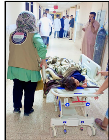
Alif Dinar Volunteer team accompanies a child to the surgery room in Hospital

The team is officially licensed by the Voluntary Work Center at the Ministry of Youth and Sports, and the team's management plans to upgrade themselves to an organization, and register it with the Ministry of Planning, to get more support from donors, open other branches, and train more youths in volunteering skills.