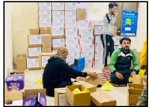
Distribution of Humanitarian Aid of Alif Dinar Volunteer team

The team conducted activities like strengthening the partnership between civil society institutions, local communities, and community police; enhancing internal security; and the rule of law. Resources are limited, but ambition is infinite. The team's goals are relief and development.