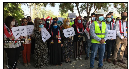
Students advocating for change in Kirkuk. With no job opportunities, many recent graduates have since emigrated from Iraq.