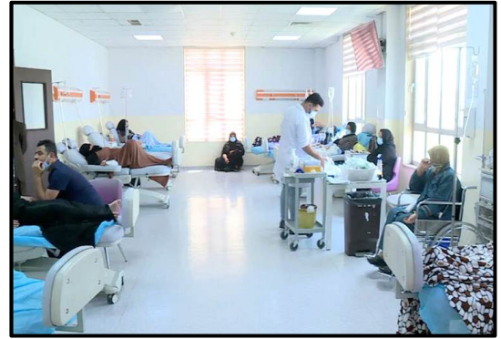
Hiwa cancer treatment hospital in Sulaymaniyah