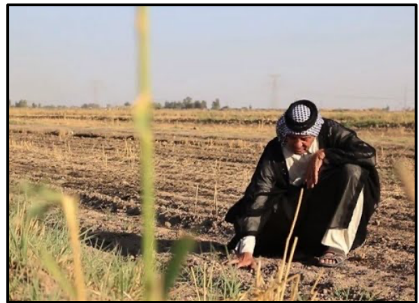
Water shortage for paddy plantation

It is consumed daily in Iraqi meals with an average of 3.4 kg per month with the government providing subsidized 3kg each month for each person through the Public Distribution System (PDS), but with irregular delivery as rice was distributed only 6 times during 2021.