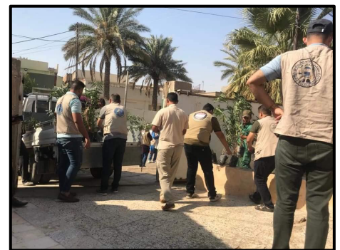
A forestation campaign of Alif Dinar Volunteer team