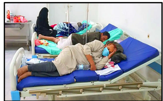
Cholera patients receive treatment in Sulaymaniyah hospitals