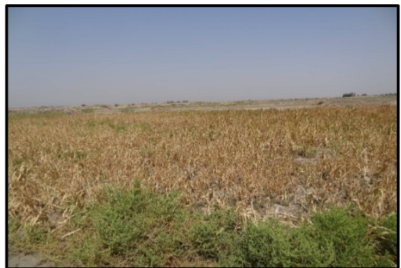
Drought hits the crops