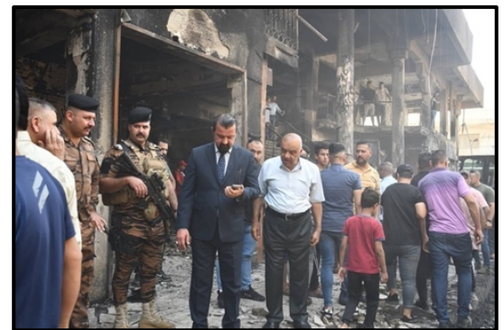
The remaining of the Business complex

The mayor of Baquba district, Abdullah Al-Hayali, said that the fire led to the burning of sixty-eight shops, noting that the losses amounted to about five billion Iraqi dinars, equivalent to $3.3 million.