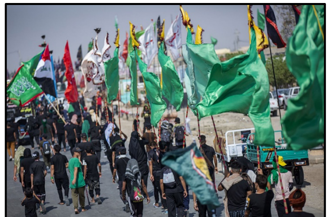
Pilgrims march towards Karbala carrying flags for the occasion