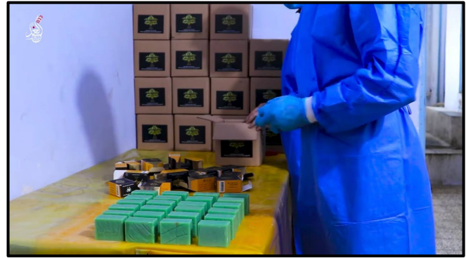
Packaging Process

Saleh's soap one of these companies. He tries to overcome those obstacles by producing a distinguished product with competitive prices.