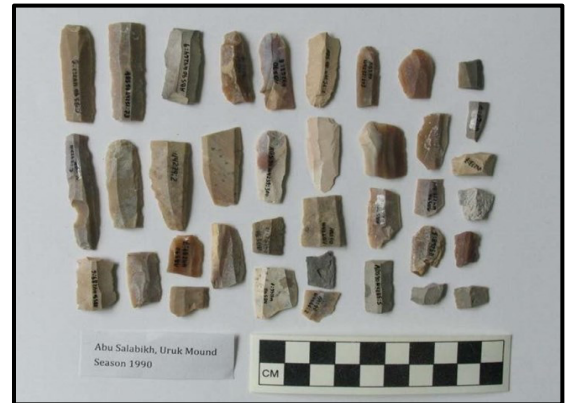
Some of the historical artifacts retrieved by the Iraqi Embassy