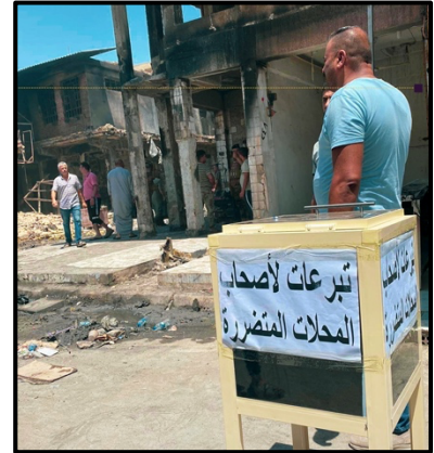
Donation campaign imposed by the nearby shops.

Regardless of who is to blame, the Diyala Chamber of Commerce was a pioneer in providing a helping hand to the owners of the shops by appealing to everyone in Diyala to participate in a donation campaign that provided nearly sixty million Iraqi dinars ($40,000).