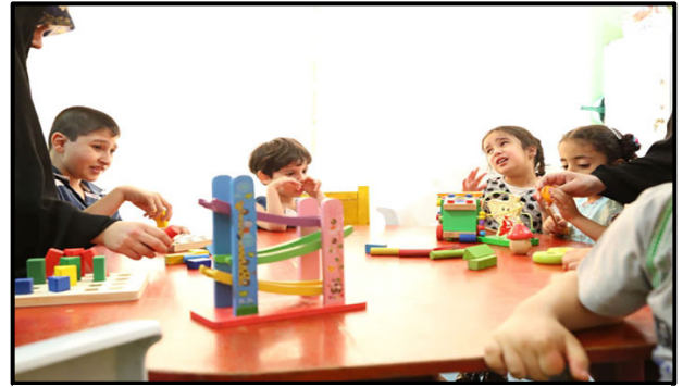
Children in Learning class @ Autism Institute page

enhance children's skills at a low cost. The monthly fee ranges from 50,000 to 250,000 Iraqi dinars ($35 to $170). Treatment includes using play to help a child learn how to think and behave differently.