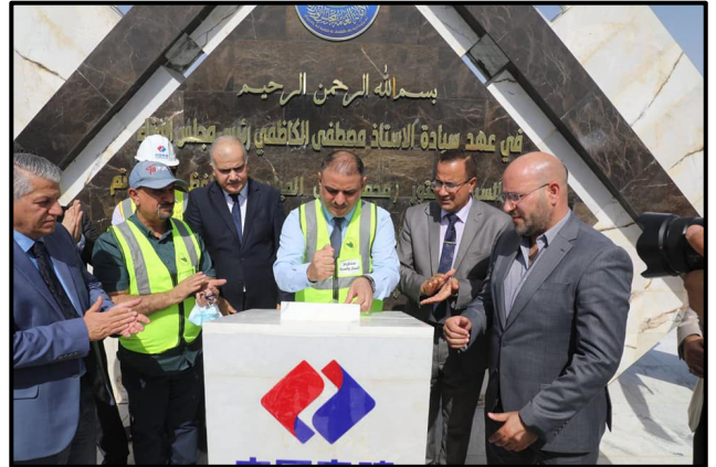
Wasit Governor Lays the Foundation Stone for Launching the Works in the Chinese Schools in Wasit Province

The local government has laid the foundation stone for the construction of forty-eight schools according to the Iraqi Chinese framework agreement. The schools will be constructed by Power China Company within a period of two years.