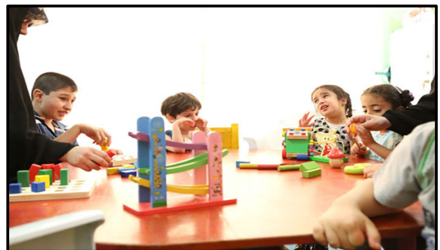
Children in Learning class @ Autism Institute page

The institute provides care and specialized services, including one-on-one behaviour therapy with training for parents to help