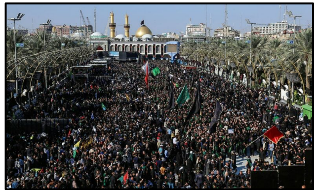
Shiite pilgrims commemorate Hussein in Karbala