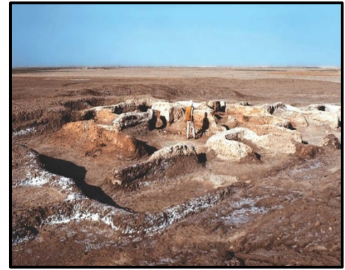
Abu Salabikh Historical site

The site consists of several mounds and only eroded traces remain on the site's surface of habitation after the Early Dynastic Period.