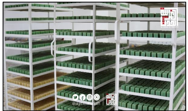
Drying stage