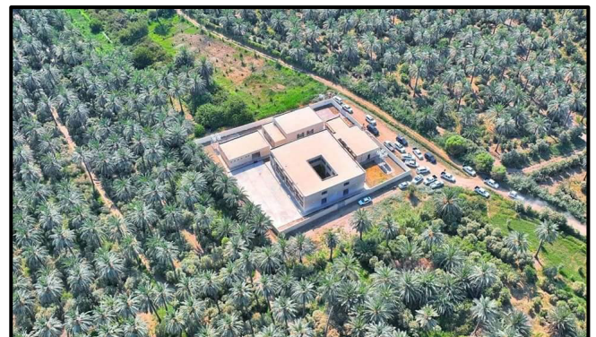
Aerial view shows Al-Shejairia Primary School in Al-Suwaira District

On the 2 October, the Wasit local government inaugurated two school buildings in the rural areas of Al-Suwaira district, 160 Km north of Kut City. The schools have the capacity to accommodate eight hundred students.