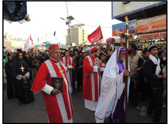
A procession of more than forty Christian clergymen visited Karbala to perform Muharram ceremonies

Poetry is the sister of sorrow they say, and lamentation poetry is an integral part of Ashura, as shown by the poetry competition events and the continuous introduction of new literary forms and contemporary artistic content. Consequently, the impact of the tragedy spilled over to stamp the Iraqi songs with sad tones as some Iraqi art critics argue.