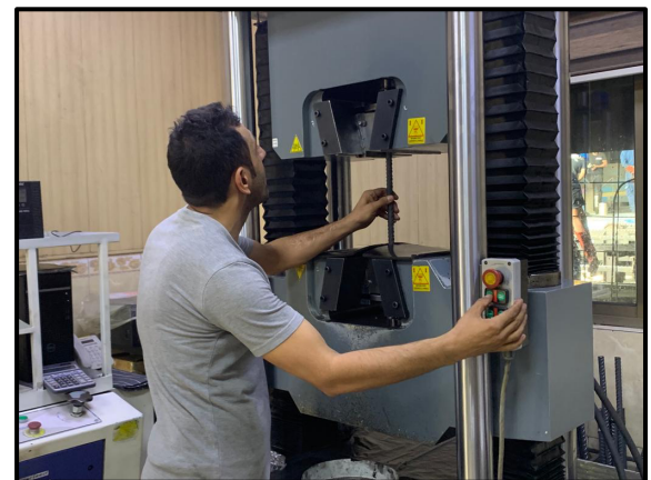
Quality control laboratory test

Many traders and construction contractors do not pay attention to the quality of materials used in construction projects. Using cheap and poor-quality materials shortens buildings’ lifespans and make them vulnerable to natural disasters that may lead to human and material losses. The collapse of the National Laboratories Building in Baghdad was one of the recent examples brought up in the discussion.