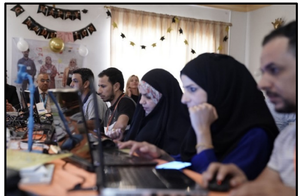
Teachers participated in the program

It is so important to enhance collaboration to take advantage of all available learning