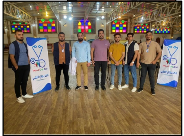
Volunteering medicine students at the festival © volunteering team.

UNAMI-DSO Saladin contacted these agencies about support for next year, and they said that they may be able to do so in the future. These organizations have no set plan or programs to be implemented in this area, so the activity will again rely on the donations of rich people and the efforts of doctors in the area.