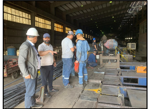
Steel bars production

This represents 91 percent of the total annual production in Iraq. However, local production is threatened to shrink in the coming years due to the increased dependence on imported production that reached 830,000 tons per year.