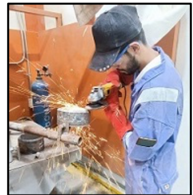
Pipe Fitting course in Nassriya VTC

Firas Salem, the President of the South Youth Organization, says that the government and private sector need to be more responsive, willing, and able to provide more tailor-made vocational training opportunities.