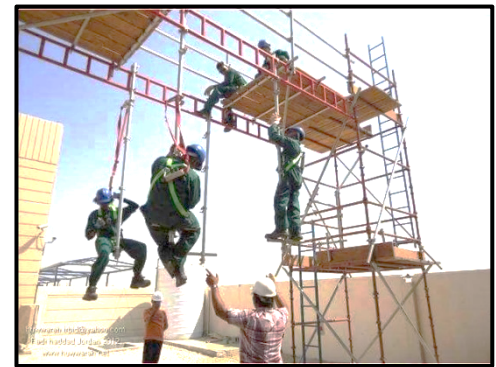
Workers in oil companies stick more to the OHS requirements

In Basra, ILO is implementing two projects that will contribute to socio-economic development by enhancing the application of international labor standards and national labor. The projects also aim to improve working conditions and respond to decent work priorities at the national level and labor market governance.