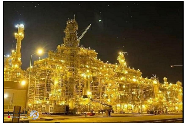
Karbala oil refinery

Economic experts are optimistic about this refinery but not totally satisfied since Iraq is likely to remain a net importer of gasoline/gasoil until 2030 given the mismatch between product output and domestic demand, as Ahmed Mehdi, research associate at an international Institute for Energy Studies observes.