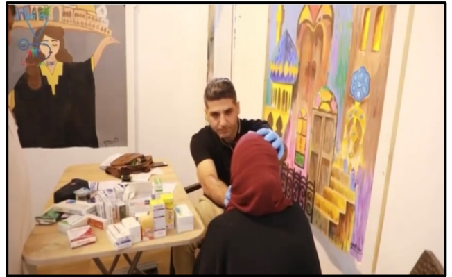
A volunteering doctor checking patient