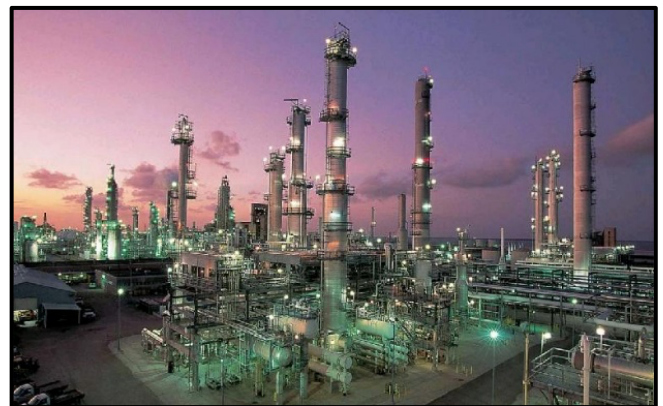
Trial production started at new oil refinery

The project started in 2009 with the design phase and the bidding process was completed in 2012. The refinery was built by a joint venture (JV) led by Hyundai Engineering & Construction (HEC) and many other international specialized companies. The JV was awarded to complete the engineering, procurement, and construction works in April 2013 with a total cost of $6.04 bn. The construction process was delayed due to a budgetary crisis in 2014.