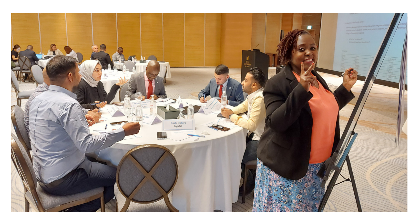
Figure 9: Group exercise

"Support to Iraq electoral process: support to CoR election 2021 and capacity development" project that started in October 2020 was supposed to end in 2021. But due to the request of the IHEC, the project's term was extended until December 2022. This project gained funding support from 12 partners such as USAID, Germany, Norway, France, Netherlands, European Union, Philippines, New Zealand, Denmark, Japan, United Kingdom, and Sweden.