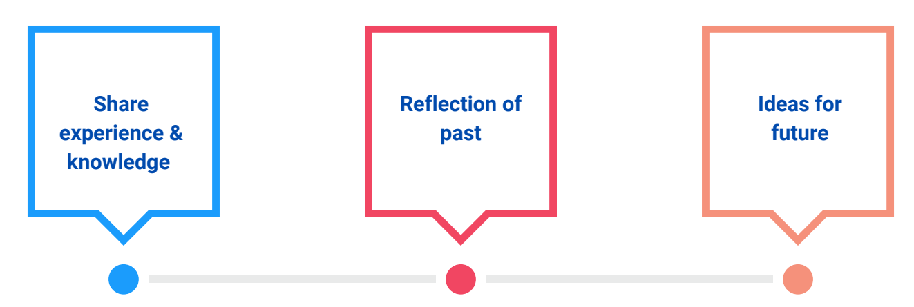
Figure 1: Goal of the conference

The main goal of the conference was to enable GEO Liaison Officers to share their experiences and knowledge and to reflect on how to improve their role and their performance as stakeholders in providing support to the electoral process in Iraq.