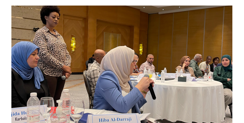
Figure 7: GLO from Diyala sharing her views

In the beginning, it was very difficult to work. There was only female staff in the logistics unit, her role was limited to administrative work, and she never visited the warehouse in her 12 years of work. I communicated with the GEO team, built trust with the head of the unit.