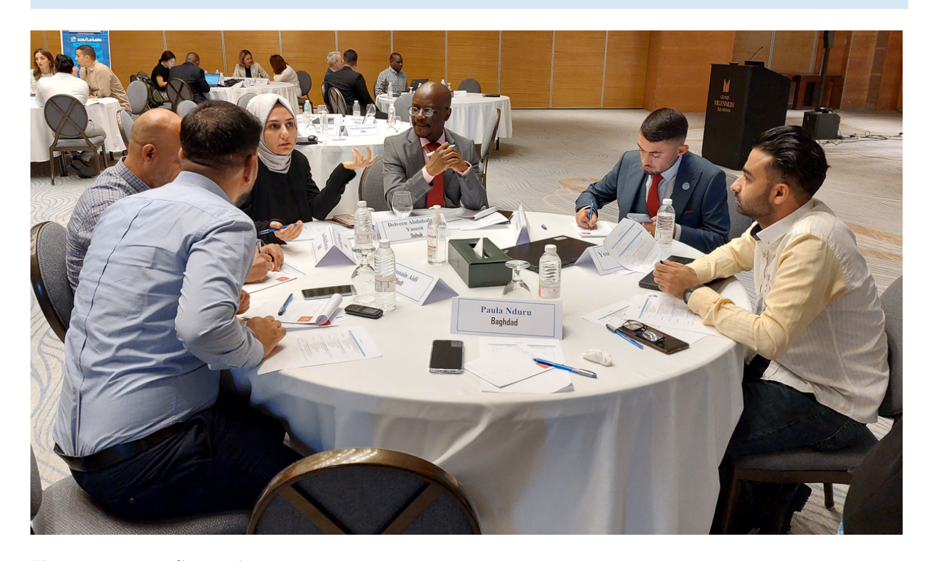
Figure 6: Group discussion