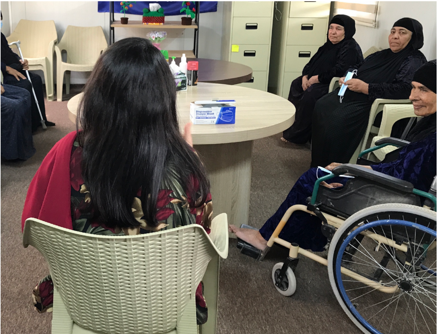
Figure 1: Community members with and without disabilities attending MHPSS awareness session at Hassan Sham Camp

I. Prioritize enablers that assist persons with disabilities to facilitate their own safety and security.