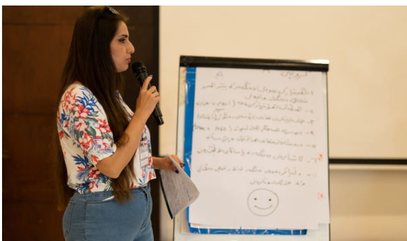
Figure 5: Participants sharing her observations on voters education process

The presentation highlighted the importance of analyzing and understanding the audience, including demographic information, media consumption behavior, and economic status, to develop effective voter education strategies. It emphasized the need for a clear and concise message that is relevant, credible, consistent, emotional, action-oriented, and memorable.