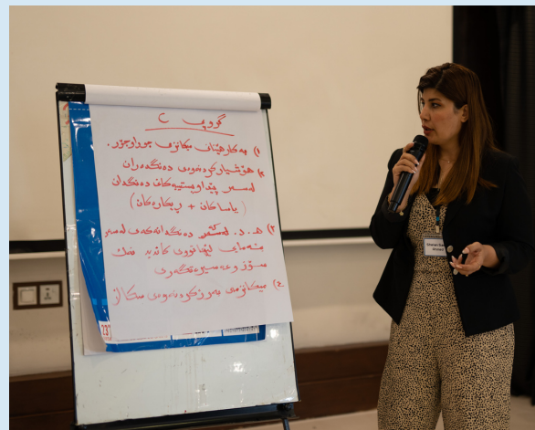
Figure 6 and 7: CSO representatives presenting after group discussions