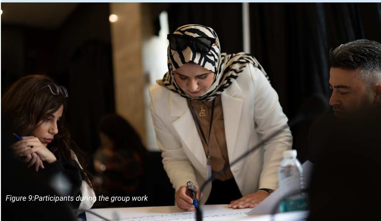
Figure 9: Participants during the group work