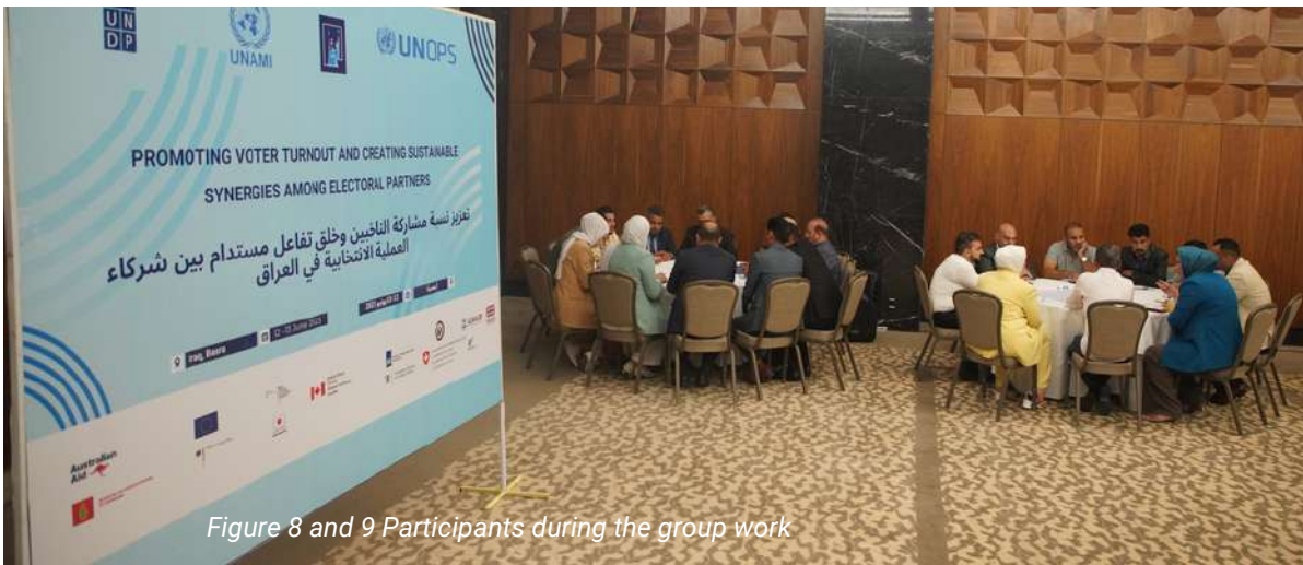
Figure 8 and 9 Participants during the group work