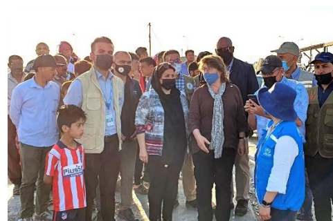
Humanitarian Coordinator Visit to Shariya Camp

The Humanitarian Coordinator visited Shariya camp on 9 June 2021 with OCHA and other partners to meet families affected by the fire and ascertain more on the plans for upgrading shelter options in Shariya and other IDP camps in the KRI.