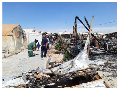
Fire destroys part of Shariya IDP camp on 4 June 2021, Duhok Governorate