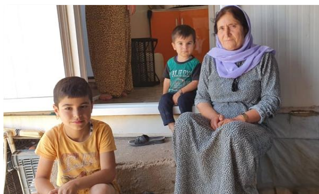
Sinjari family displaced in Mamrashan IDP camp (2021)

In June 2020, the Iraq Inter-Cluster Coordination Group (ICCG) published a Situation and Needs Monitoring Report , evaluating the implementation of the humanitarian response in Iraq between January - May 2021, and taking stock of the changing operational context in Iraq during this period. Its analysis summarizes key trends and changes in the humanitarian situation and evolution of needs based on available data provided by the clusters.