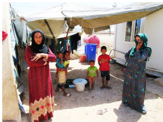
IDPs near the former Balad train station informal site, Salah Al-Din

In June 2021, OCHA coordinated a key inter-agency mission to Salah Al-Din, providing coordination and logistics to a protracted displacement site in Balad, which has experienced long-standing challenges for humanitarian access.