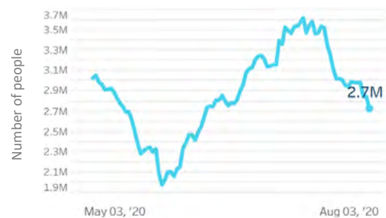
Figure 2. Number of people with insufficient food consumption, where insufficient consumption refers to those with poor and borderline food consumption according to Food Consumption Score (FCS) using a seven day recall.

Consumption Patterns. On 3 August, the WFP Hunger Monitoring System estimated that about 2.7 million people had insufficient food consumption. Compared with a month ago, this was a decrease of 430,000 people. Compared to the last week of July, the number of people using negative food-based coping strategies declined by 120,000. Only approximately 13.8% of respondents reported adopting negative coping strategies, representing 5.3 million people. This is calculated based on a standard food based Coping Strategy Index (rCSI). Relying on less expensive food remained the most common coping strategy, with 28.6% households reporting adopting it. All estimates were based on a statistically significant sample where 1,620 households, interviewed over the telephone.