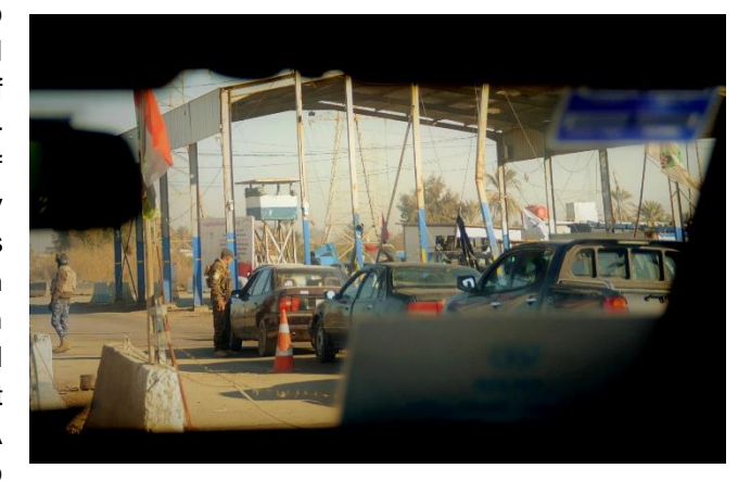
A checkpoint in Tikrit, September 2020

In 2020, humanitarian organizations operating in Iraq continued to face a range of obstacles regarding the access of personnel and materials. These challenges, which hamper the ability of humanitarian organizations to provide assistance to conflict-affected populations, include restrictions of movement of organizations, personnel, or goods within Iraq and military operations and ongoing hostilities, among others. Access impediments can also include violence against humanitarian personnel, assets and facilities; interference in the implementation of humanitarian activities; presence of mines and unexploded ordinances; difficult physical environment; or obstruction of conflict affected people's access to services and assistance. OCHA continues to engage with the relevant authorities at all levels to alleviate these obstacles.