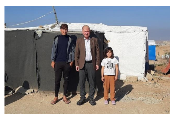
Out-of-camp IDPs living in an informal settlement in Khanke