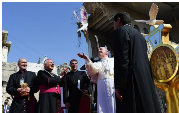
In early March 2020, Pope Francis visited Iraq, the first-ever papal visit to the country, which has a vibrant Christian minority