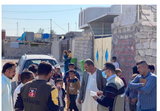
IDPs in an informal site in Kirkuk describe their needs

More than 275,000 acutely vulnerable Iraqis continue to be displaced outside IDP camps in approximately 950 self-settled and informal sites, often in widely dispersed locations that may be difficult to reach or have little access to services. On 18 November, the OCHA Kirkuk field office travelled to Daquq to meet with the IDPs to gain a greater insight into the humanitarian situation in the district and reasons for protracted displacement in Daquq's 26 informal sites, home to 13,694 displaced people. Daquq is considered to be a part of the "Disputed Internal Boundaries" of Iraq, with competing claims to land by Arab, Kurdish and Turkmen inhabitants dating back to the 1970s.