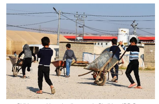
Children pushing wheelbarrows in Sheikhan IDP Camp

The region could also potentially benefit from the recently announced extension of the United Nations Development Programme's (UNDP) Funding Facility for Stabilization (FFS). In early November 2020, the Government of Iraq and the FFS Steering Committee announced a three year extension of the UNDP program, which will target the remaining priority needs of areas liberated from ISIL, including Anbar, Diyala, Kirkuk, Ninewa, Salah Al-Din. The FFS will expand its focus to areas that have experienced difficulty with returns, and provide support to Iraq's displaced populations through the rehabilitation of critical infrastructure and services damaged during the conflict against ISIL, and address the creation livelihoods, local capacity development and social cohesion.