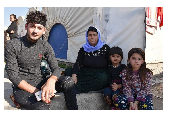
Families in Essian IDP Camp, northern Ninewa