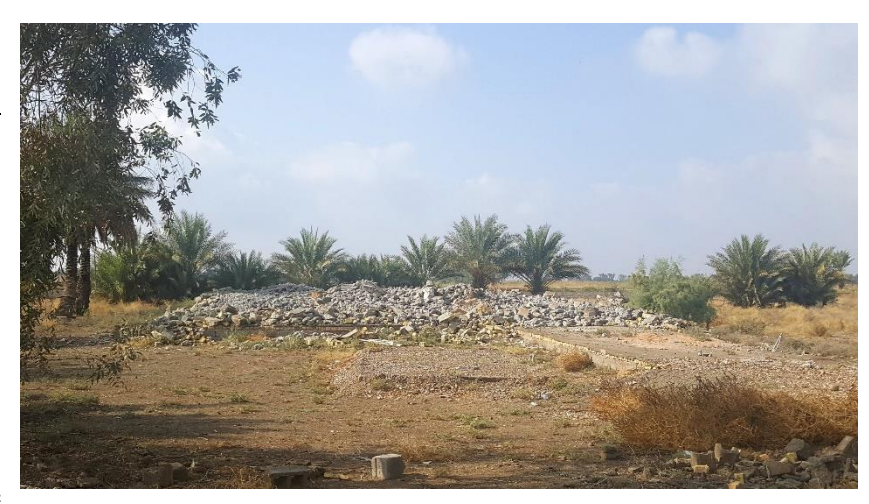
A destroyed home in al-Khairat sub-district, in Al-Anbar governorate.

In late November, OCHA and other members of the Al-Anbar Governorate Returns Committee visited the sub-district of al-Khairat, in the northeast of Al-Anbar governorate, near the border with Salah al-Din and Baghdad governorates. Several households returned to the area in the context of recent camp closures, and now find themselves in secondary displacement, either due to the destruction of their houses or because of lack of acceptance by community members due to perceived affiliations with ISIL. The lack of shelter is the immediate need for returnees, in