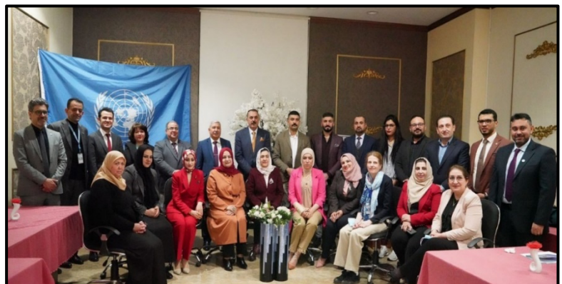
Participants concluding the Round Table Discussion to celebrate International Women’s Day in Kirkuk.