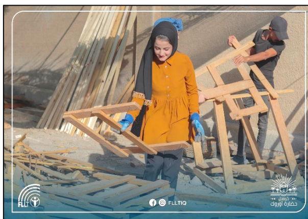
Rana prepares for the Carnival

The team of volunteers also organized three carnivals to send a message of peace, solidarity and support to cancer fighters. They also trained leaders in programs that included discussions about diversity to strengthen citizenship, entrepreneurship, human rights, psychological support, and the principles of media to support youth in Muthanna Governorate and improve public opinion.