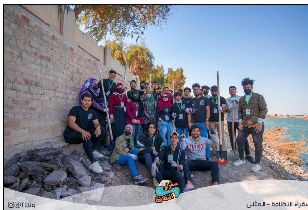
River Cleaning Campaign