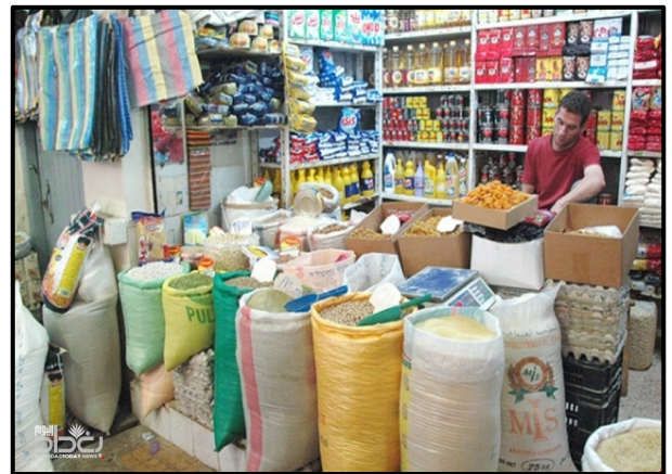
Markets with no shoppers in Baghdad @Al-Jazeera net

He called on the authorities in Iraq to take practical measures to achieve food security by supporting the agricultural sector, helping farmers, and increasing agricultural areas throughout the country. He also urged the government in an interview with a local TV channel (Al Iraqiya) to support the private sector and factories that produce foodstuffs such as