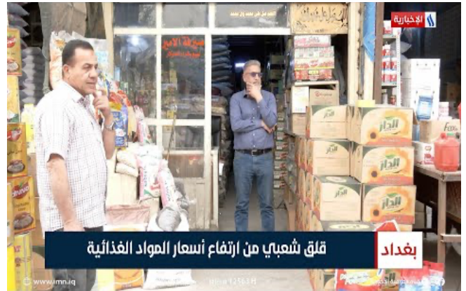
No one is interested in buying food items @IMN

Hannoun indicated that there are accelerated measures to secure foodstuffs, especially oil and sugar. He added that work is underway to find a parallel line to support the government's approaches through the commercial market and pump large quantities of food baskets to beneficiaries.