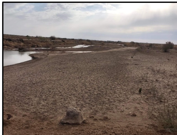
Al Adhim river drought stream in northeast of Dhuluyah sub-district ©UNAMI-DSO.

“Time is out for our farms to grow properly and produce even if we get irrigation water now.” Not only have these farmers expended a lot of money on their farms, but they still have hope that the government may sympathize with them and compensate them for their losses.