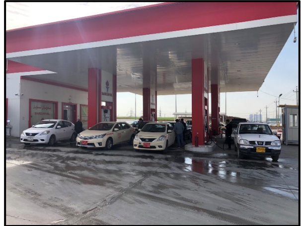
Fuel station sells government-subsidized fuel in Erbil

The supply of this fuel is also limited, as only 20 fuel stations receive and sell the Iraqi government-subsidized fuel in Erbil Governorate. He said the scarcity of affordable fuel has led to racketeering, fuel smuggling from neighboring governorates, and black-market trading. Shortages of fuel are reported in neighboring Ninewa Governorate due to the influx of drivers from Kurdistan searching for cheaper gasoline.