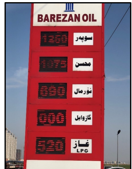
Fuel prices board of a fuel station in Erbil

Unless the local authorities step in to subsidize the current prices or remove some tariffs, the prices will continue to rise. Unfortunately, the crackdown on illegal refineries and the black-market sellers by local government officials also affected the local oil market. The full control over fuel prices is now in the hands of pump operators and their distributors.