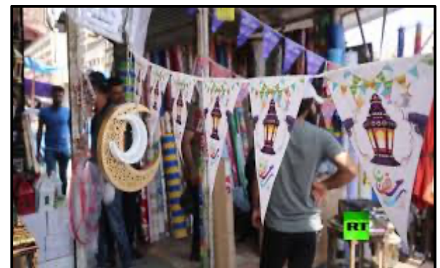
Ramadan decorations didn't attract the buyers @RT