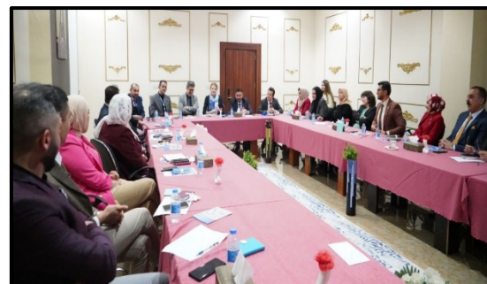
A Round Table Discussion for International Women’s Day with the PENA Center, Government Officials, UNAMI, OHCHR, and UNFPA.

On 9 March, DSO participated in a roundtable on women's roles in combating climate change. The participants discussed environmental degradation, chemical pollution, and the high prevalence of children with cancer in Kirkuk.