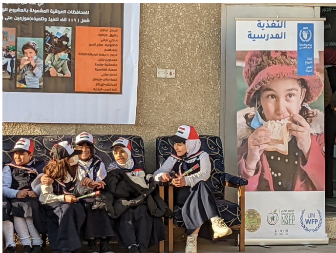
Photos: Left: School girls attending the inauguration ceremony of the School Feeding Programme in Baghdad's Sadr City for the academic year 2021/2022. Right: WFP Tech staff at the Public Distribution System for food rations (PDS) Branch in Baghdad's Sadr City oversee the implementation of the digitalized features of the PDS reform.

Following WFP's proactive work with the Ministry of Education (MoE) to hand over the programme, in January began a partial transition of 40 percent of operations to direct implementation by the government in the 2021/22 academic year. WFP continues to provide technical advisory and procurement support informed by years of experience of delivering school feeding programmes in Iraq and worldwide.