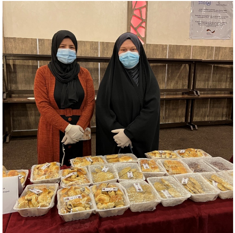
Photo: At the first Hamdaniya pop-up Food Festival, women sold home produced food such as delicious pastries and snacks using the value-addition and business skills they learned during WFP & partners' training.