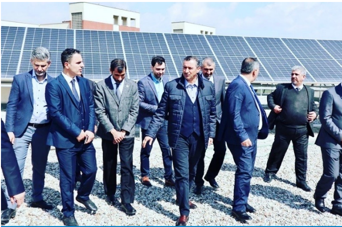
Photo: The first solar energy system is installed at the University of Sulaymaniyah, benefiting the whole Career Development Center, students and staff who use it.