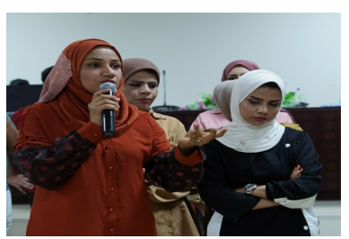
Launch of the agri-business awareness campaign for youth

(Ninewa and Basra, September-October 2022)