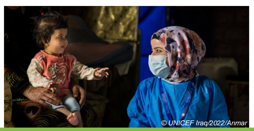
Reporting Period: 1 April to 30 June 2022