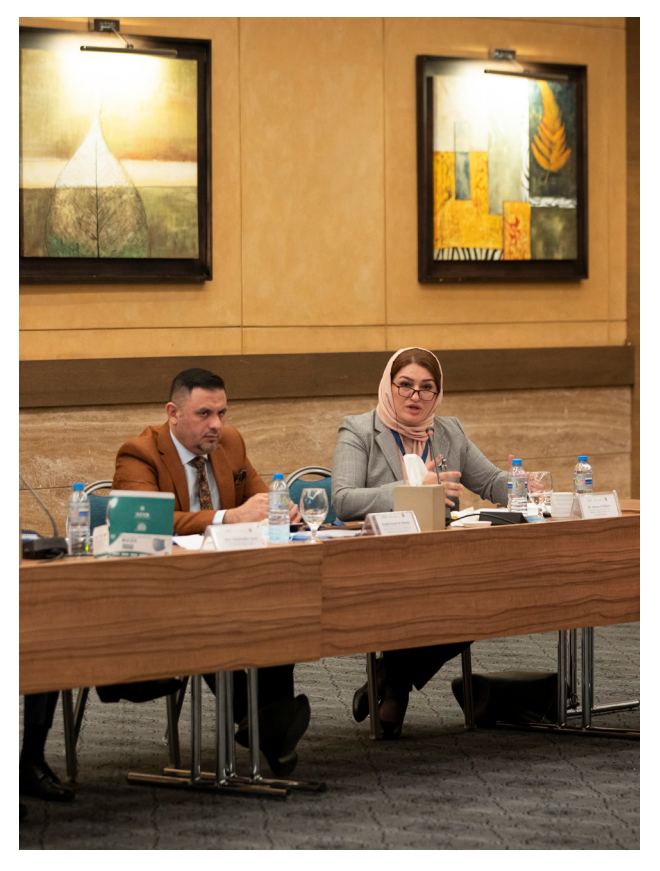
Figure 3: Yad Andulqadir/IOM Iraq

In terms of risks for both individuals carrying out PVE work, as well as risks to the broader gender equality agenda, these are highlighted in the table below. These risks should be carefully considered and mitigated in all PVE efforts.