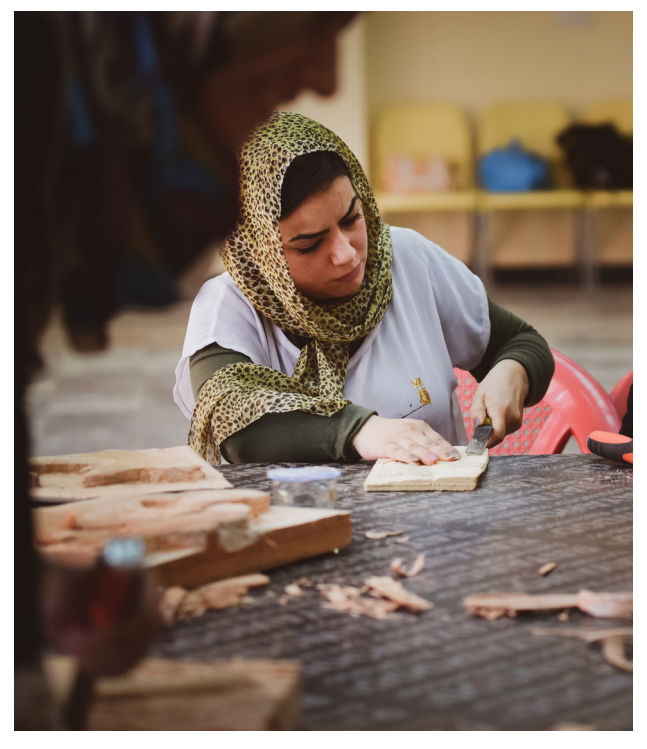
Figure 2: Raber Aziz/IOM Iraq

In the aftermath of ISIL rule/presence, there are both short and long-term needs in the parts of Iraq where they held territory or where displaced peoples are seeking to navigate return, and all of these have gendered issues to consider. As an example, female-headed households, of which there are many, face specific issues as they seek return. However, there are also ongoing risks as the group re-engages in remote parts of the country today, and as other forms of violent extremist organising develops. While ISIL could be one case study of VE in Iraq, the group's ideologies, practices, and communications highlight the centrality of gender relations, norms, roles and violence in the function and ideological underpinnings of violent extremism. It is therefore vital that gender is considered carefully and seriously in any response to VE in the country, and in work that attempts to prevent future vulnerabilities to violent extremism in all its forms as Iraq continues to face old and new challenges related to security and governance.