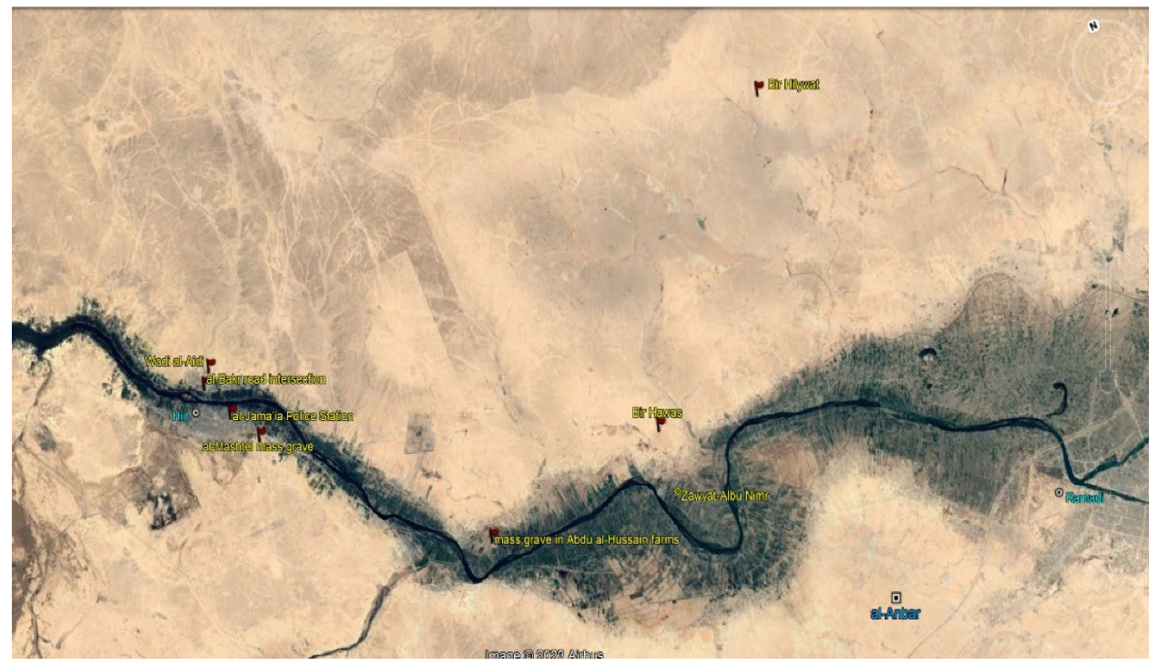
Map of the main crime areas, extracted from Google Earth.