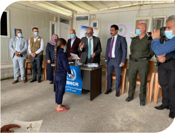
Ceremony marking handover of civil documents through mobile missions in Dohuk 2021

UNHCR continues to support mobile missions by government officials to IDP camps to receive and process applications for civil documents and to issue civil documentation.