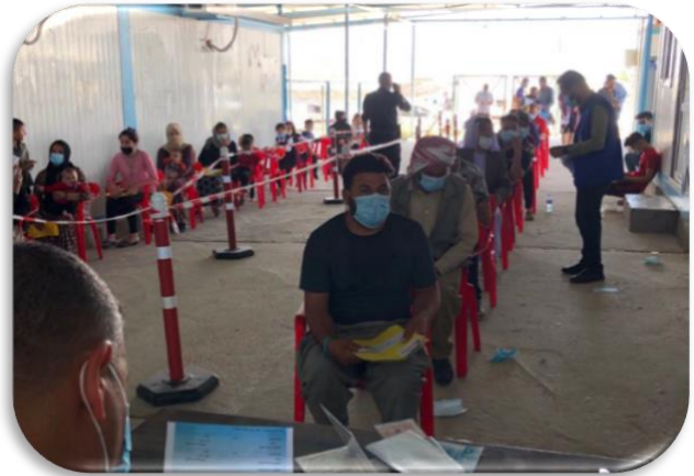
Processing applications for civil documents during Dohuk mobile missions 2021

In response, in 2021 UNHCR, in cooperation with government and civil society partners, continues to implement and supports projects and initiatives to enable IDPs and returnees to access civil documentation .