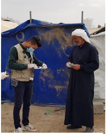
Cash-for-food distribution in Anbar

WFP, the Food and Agriculture Organization and the World Bank are undertaking an ongoing joint assessment on the impact of COVID-19 on the food security of vulnerable people, both in and out of camps, including food prices. WFP publishes monthly reports on market prices and is monitoring changes in market prices to ascertain