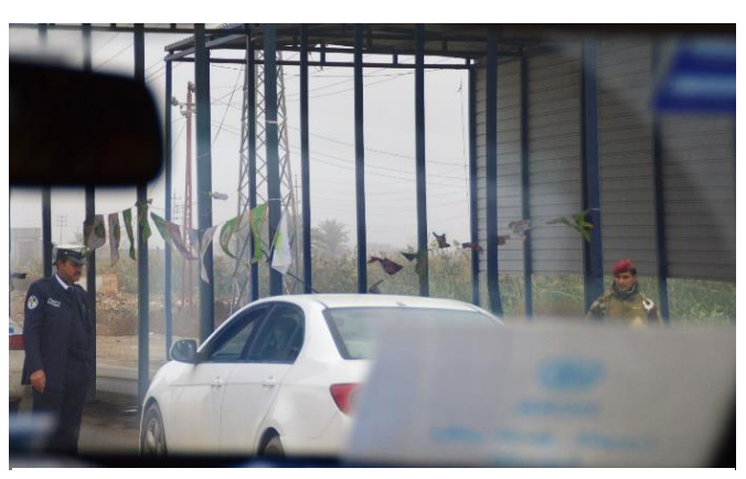
Checkpoint in Anbar Governorate

The Humanitarian Coordinator, OCHA and NGO Coordination Committee for Iraq (NCCI) have been working since early 2020 with both the central government in Baghdad and governorate authorities to establish a predictable, transparent, timely and fair access authorization system. To support the fulfillment of access requests with the National Operations Centre (NOC), NCCI has established a temporary access support unit to validate NGO access letter applications before OCHA periodically submits them to the NOC, thereby reducing delays caused by administrative errors. COVID-19 movement restrictions have added an additional layer of access issues. There are 1.5 million Iraqis in need of humanitarian assistance who live in districts with medium or high severity of access constraints.