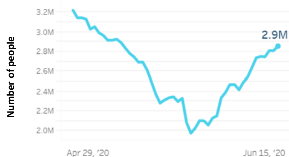
Figure 2. Number of people with insufficient food consumption, where insufficient consumption refers to those with poor and borderline food consumption according to Food Consumption Score (FCS) using a seven day recall.

reported adopting negative coping strategies. Given the sample size, this represents around 5.4 million people in the country, an increase of 40,000 people from last week. “Relying on less expensive food” was the most commonly used coping strategy, with 30.8% of whom using copings were employing this strategy. Around two million households reported that they faced challenges to access markets, an increase of 70,000 households compared to last week. “Travel restrictions” were the most commonly reported reason that people could not access markets. Around 0.7 million households reported that they faced challenges accessing health facilities, which was an increase of 30,000 individuals compared to the last week.