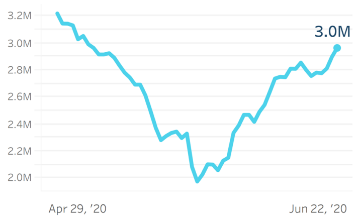
Figure 2. Number of people with insufficient food consumption. where insufficient consumption refers to those with poor and borderline food consumption according to Food Consumption Score (FCS) using a seven day recall.

Consumption Patterns. On the 22<sup>nd</sup> of June, WFP mVAM data revealed that around 7.8% respondents, which represents approximately three million people, do not have sufficient food consumption. Compared to last week, this is an increase of 500,000 people. These estimates were based on a statistically significant sample —on a monthly basis, 1,620 households were interviewed via the telephone on a monthly basis. The data also revealed that 13.7% of people were using negative food-based coping strategies. Of that subset, 31% of people reported that they primarily "relied on less expensive food".