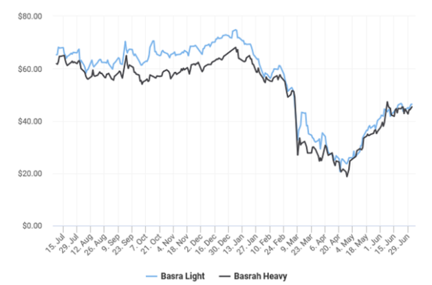
Figure 1.Basra light and heavy oil prices per barrel over one year. 1

The novel coronavirus (COVID-19) pandemic continued to spread in the country. As of July 5, 2020, the World Health Organization reported 58,354 cases in Iraq, with 2,368 deaths. The government continues to enforce lockdown and curfew measures in an attempt to curtail transmission. Oil prices also continued to be monitored closely. Basrah light and heavy oil, remained relatively stable in the last week, respectively at USD 46.33 and USD 45.33 per barrel. Prices have partially recovered since April and May 2020; however, they have not returned to 2019 levels. On July 8, 2019, the price of Basrah light was USD 65.27 per barrel and Basrah heavy was USD 61.81 per barrel, respectively a 29% and 27% decline compared to 2019 prices (Figure 1). The Ministry of Planning Central Bureau of Statistics announced that during the first quarter of 2020, Iraq exported an average of 3.8 million barrels per day with an av-