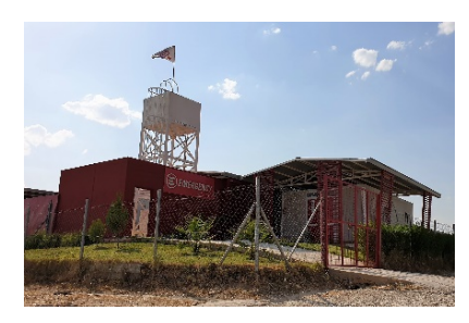
Primary Health Care Centre in Ashti IDP Camp, Sulaymaniyah.

OCHA sub-offices in Duhok and Sulaymaniyah governorates of the Kurdistan Region of Iraq (KRI) report that significant gaps in health services in camps in the two governorates are expected in 2020 due to funding shortfalls, and a lack of capacity by partners to take over from the World Health Organization. Service mapping conducted by the Health Cluster indicates that different health partners will be terminating their projects in the coming months; the cluster, in collaboration with Directorate of Health, is working to identify alternative modalities for covering these services.