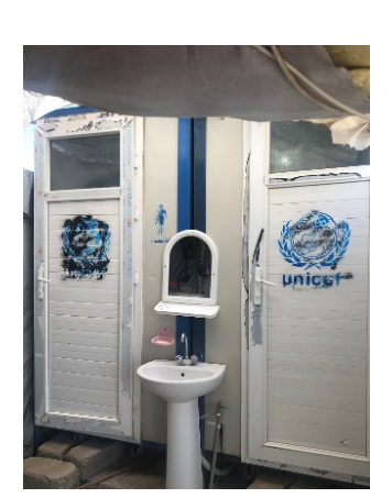
WASH Facilities, Bersive IDP Camp, Duhok.

In January 2020, the WASH Cluster informed partners that UNICEF (as cluster lead agency) was seeking to phase out as the primary WASH provider in a number of IDP camps in Ninewa and KRI, due a shortfall in funding. UNICEF and the WASH Cluster are actively seeking other humanitarian actors to take on the role of WASH service provision, in parallel to conversations with relevant authorities for potential handover responsibility. UNICEF has assured partners that it will continue being a provider of last resort until transition is formalized in affected camps. There are already plans in place for the handover of WASH services to NGO partners for certain camps in KRI, but no comprehensive solution has yet been put forward for all the impacted sites. In parallel, some WASH partners have indicated that they have supplies in place to meet any gaps over the next six months, but not for longer-term needs. Government entities in the KRI have indicated their willingness to serve as WASH providers but noted that they will require funding to support this work.