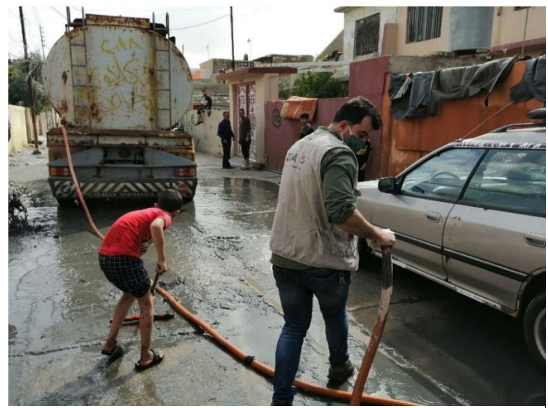
NGO ZOA helping with clean-up in Mosul after heavy rains.

Preliminary assessments showed that some limited displacement occurred as people left to stay in safer neighborhoods. Humanitarian partners including the International Organization for Migration organized a distribution of non-food item (NFI) kits to affected families. The kits include blankets, kitchen sets, jerry cans, hygiene kits and plastic sheets. Informational material about managing the spread of the Coronavirus was included with each NFI kit.