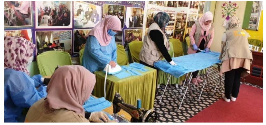
Local NGO Vera tasks Women's Community Centre in Diyala to sew masks

During March 2020, Iraqi authorities and humanitarian partners worked together to minimize the impact of COVID-19 across the country. Confirmed cases in March increased from 13 at the beginning of the month to 695 (with 50 fatalities) at month's end. On 2 March, the World Health Organization (WHO) briefed the Humanitarian Country Team on the novel coronavirus, outlining Iraq's preparedness and identifying gaps that would need to be addressed. The Humanitarian Operational Cell, chaired by the Humanitarian Coordinator, continued to meet weekly during March to coordinate United Nations' prevention and response initiatives, share information about funding and manage duty of care issues for staff.