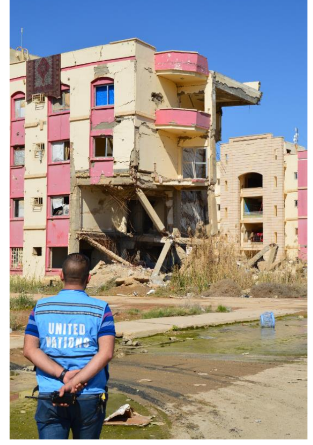
Destroyed Building Kilo 7 settlement, Ramadi, Anbar

The impact varies by governorate. Movement and transportation between governorates, and between federal Iraq and the Kurdistan Region, were prohibited by local and regional authorities. OCHA has been able to negotiate curfew exemptions for humanitarian partners within many governorates to freely move cargo and staff as operationally necessary. However, the prohibition on inter-governorate movement, including for the movement of medical supplies such as PPE and ambulances, significantly impedes humanitarian response, as many organizations are based out of Erbil or Baghdad, and have their logistics hubs in these cities.