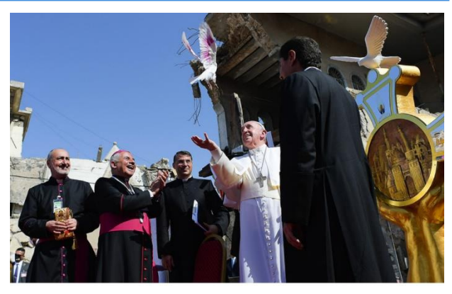
In early March 2020, Pope Francis visited Iraq, the first-ever papal visit to the country, which has a vibrant Christian minority